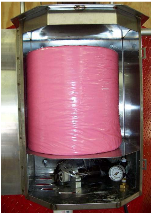
The system is now ready to work!

VM FIBER FEEDER, Inc. 7850 Fruitville Road Sarasota, Florida 34240, USA Tel: +1 941 342 9997 Fax: +1 941 342 1771 www.vmfiberfeeder.com info@vmfiberfeeder.com