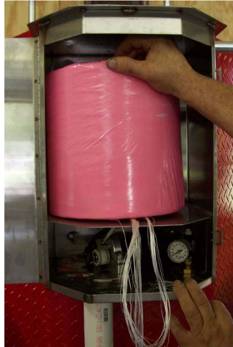
Hold it a little bit while chopping the strand in excess