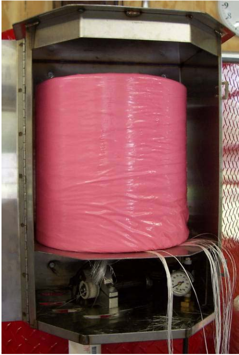
Place the bobbin